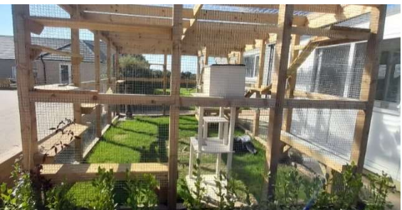
Thank you to everyone's generosity that made this possible.